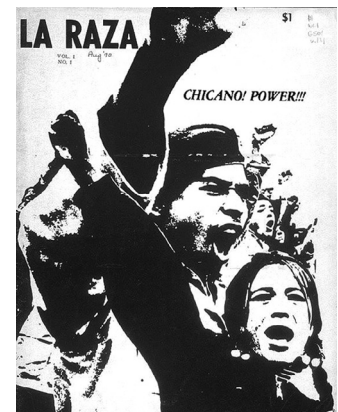
August 1970 (6)